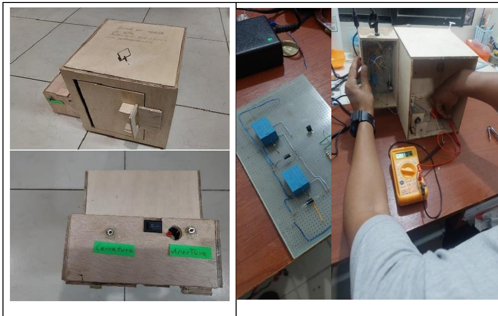
Figure 2: Photos of the implemented prototype

In the next section the experimental results are validated.